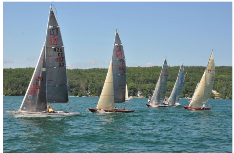
Walloon Lake 17s.

Currently, Irish Boat Shop is working on several of the 17s, getting them ready to take the title in 2016. They have two big projects involving the recoring of one of the 17s' decks and completely replacing the deck on another. Meanwhile, their riggers are hard at work improving the rigging on a few of the boats.