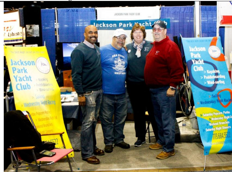
Jackson Park Yacht Club, Chicago, Illinois