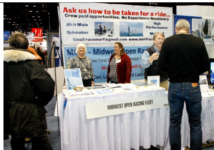
Midwest Open Racing Fleet, Chicago, Illinois