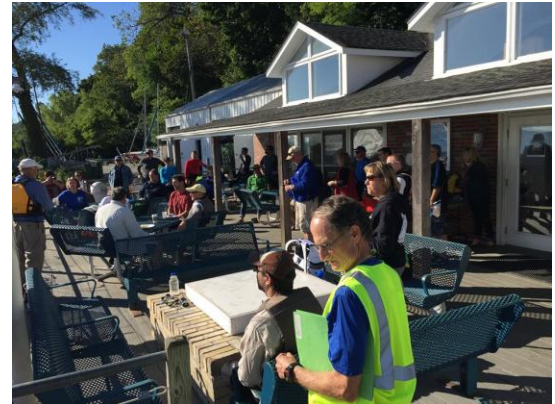
North Shore Yacht Club, Highland Park, Illinois, on the shore of Lake Michigan. A busy, thriving club.

Together, we can maintain access for ALL to Park Avenue Beach!