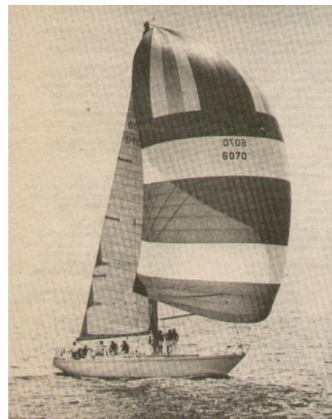
1975 Centennial Race winner Scaramouche, owned by Chuck Kirsch.

The 338 nautical mile biennial Trans Superior International Yacht Race may also lay claim for longest race on the Great Lakes. The race starts in the vicinity of Gros Cap Light in Whitefish Bay, near Sault Ste. Marie, Michigan, and finishes near the entrance to the Duluth Ship Canal in Duluth, Minnesota.