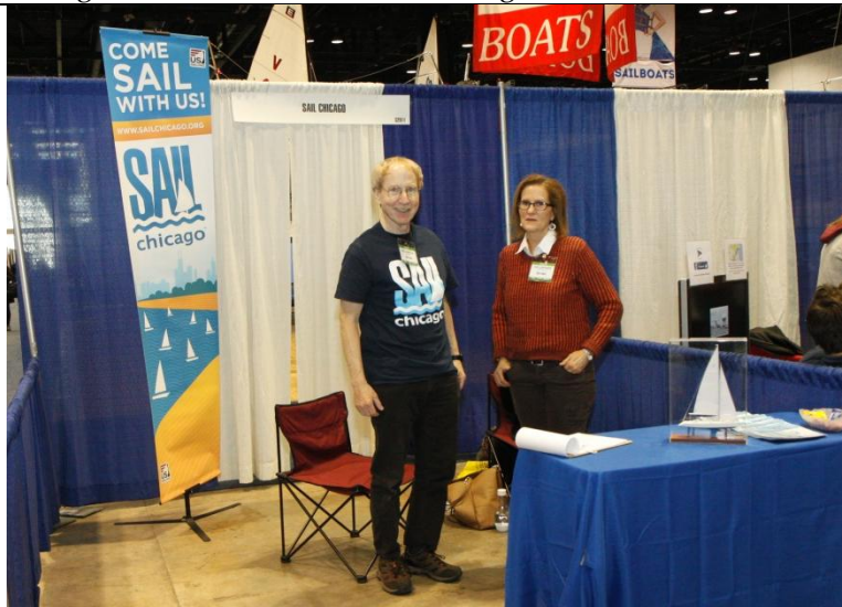
Sail Chicago, Chicago, Illinois