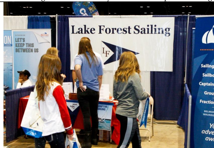
Lake Forest Sailing, Lake Forest, Illinois

Our clubs present at this year’s Chicago Boat, RV & Strictly Sail Show were busy meeting new people and even signing up new members right on the floor. Is your club in our photo montage?