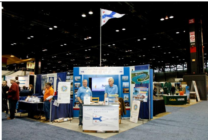
Chicago Corinthian Yacht Club, Chicago, Illinois