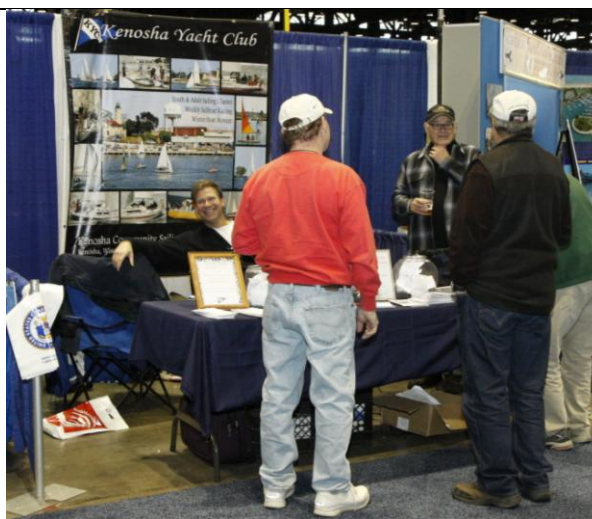
Kenosha Yacht Club, Kenosha, Illinois.