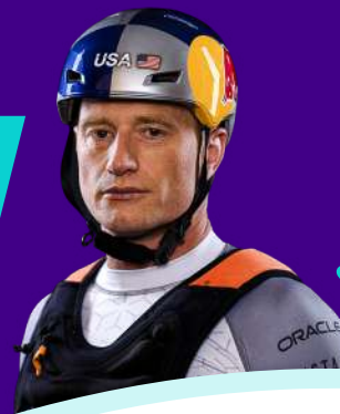
JIMMY SPITHALL USA SAILGP TEAM F50 DRIVER