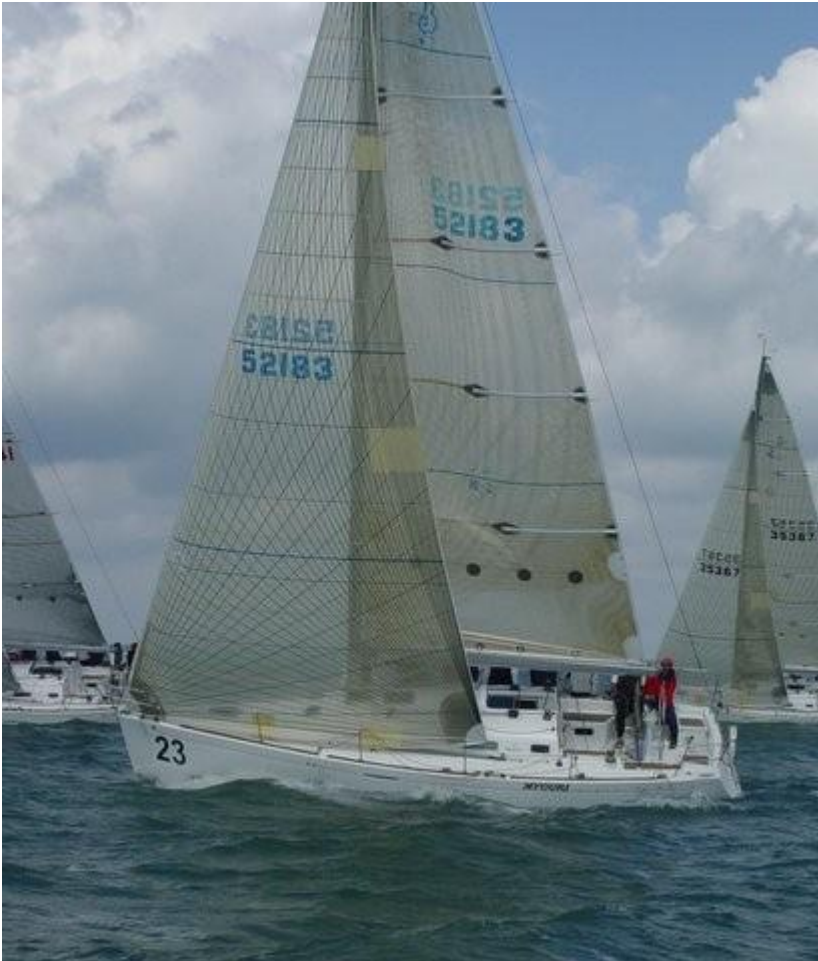
Beneteau First 36.7 "Myouri" 2004, Buffalo, NY, $99,900

power, full electronics, $99,900, Buffalo