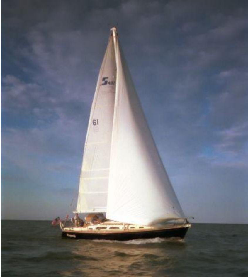
Sabre 402 "Rhapsody" 2000, Rochester, NY, $224,900

37' Tripp 37 1987 "Kamikazi" REDUCED Full Race Equipped with Loads of Sails & Electronics, Excellent Race Record, Seriously for Sale, located in Cobourg Ontario, now $39,900!