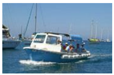
Free shuttle service between the clubs

Click on logos to visit our sponsors and supporters