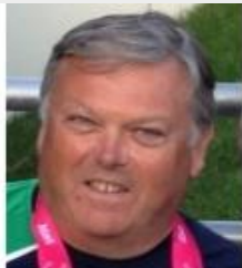
ISAF, Disabled Sailing Committee