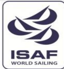
ISAF Disabled Sailing Rankings