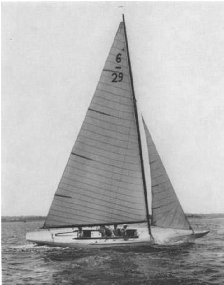
6-Metre Lanai , 1925

In 1932, the competition was back in six metre yachts. Great spectator fleets followed the competition. The Navy usually sent a large vessel to control the crowd. The media followed the competition closely through the late twenties and thirties. In the last competition before World War II, the Royal Northern Yacht Club sailing Circe successfully defended the Cup in a challenge from the Royal Norwegian Yacht Club or Norway sailing Noreg III .