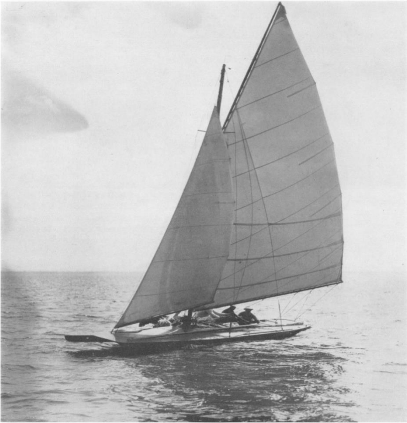
Dominion , Royal St. Lawrence Yacht Club, Winner of Seawanhaka Cup, 1898.

In 1905, the Manchester Yacht Club of Massachusetts challenged the Royal St. Lawrence Yacht Club and won the regatta. The Royal St. Lawrence Yacht Club thereafter challenged the Manchester Yacht Club in 1910 unsuccessfully and the Seawanhaka Cup competition went dormant until the six metre era and the International Rule of yacht design.