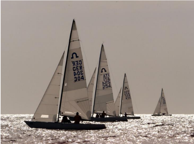
Solings racing in Long Island Sound off Oyster Bay, NY