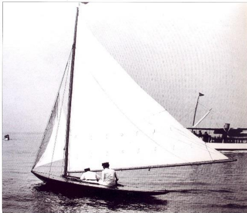
1895 – Ethelwynn , Winner of the Seawanhaka Cup.